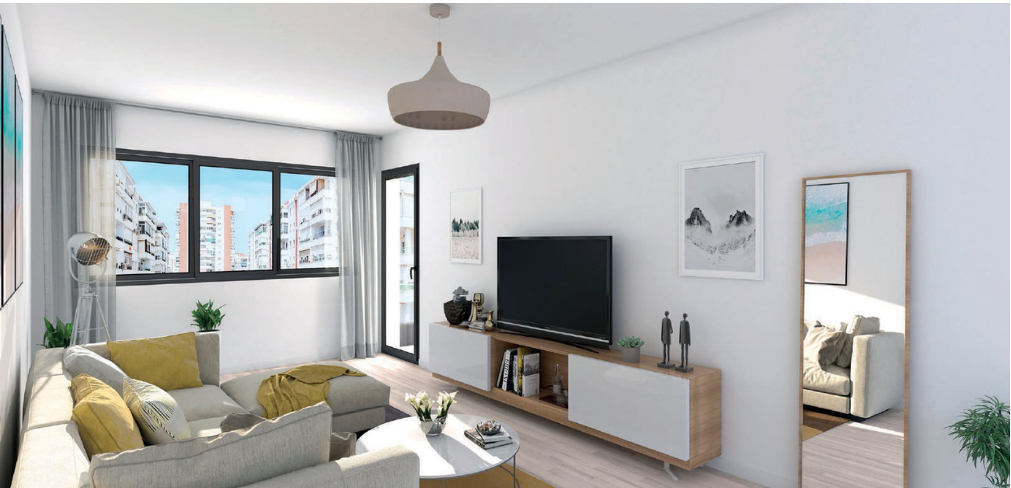
Interior of the house. Finishes